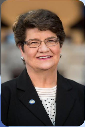
Senator Peggy Lehner, 6 th Ohio Senate District